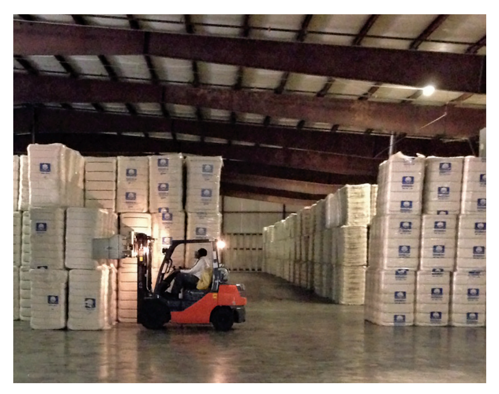
Staplcotn's new warehouse located in Greer, South Carolina, will be a certification point for ICE futures in the Greenville delivery zone. See President's Message inside for details.

NONPROFIT ORG. U. S. Postage Paid Greenwood, MS 38930 Permit No. 49